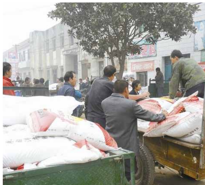
Sales at the scene of New Yangfeng fertilizer.

CAU and its national partners in academia and the industrial sector look forward to dialogues that contribute to mutual learning. A number of key Chinese actors will share first-hand experience on the prevailing issues faced by phosphate producers and users in China, in order to reach a better understanding of how sustainable transitions may be efficiently achieved. Like many in the Global TraPs community, CAU recognizes that in order to meet the growing demand for food and phosphate resources, a transdisciplinary understanding of phosphorus use, management and sustainability from a supply chain perspective is required. In this context, CAU looks forward to this conference and the sharing of information with international colleagues in a transdisciplinary dialogue as a means to support China's important role in addressing global food security, resource conservation and environmental concerns.